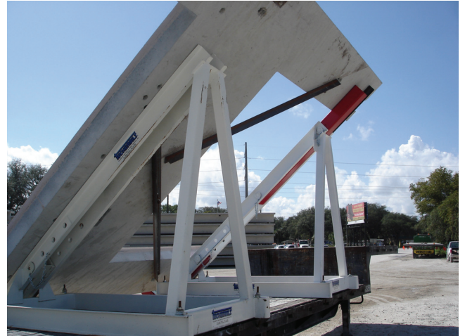
Extension Supports the Top of Window Blockout