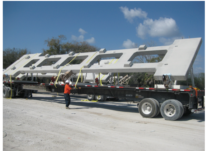
Legs Adjust to Accommodate Various Panel Widths