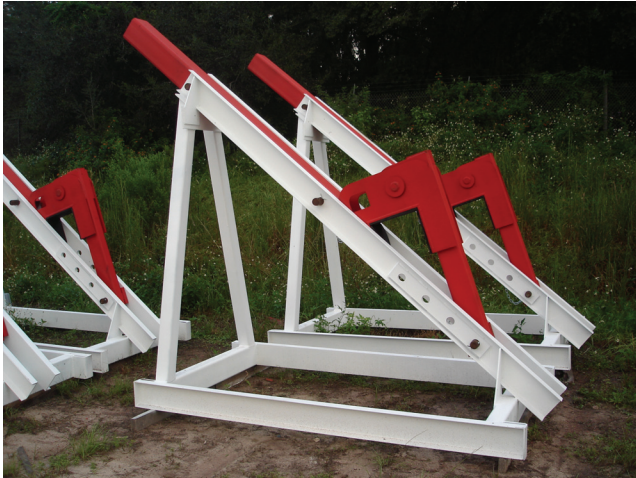
Hauling Rack with Optional Extension