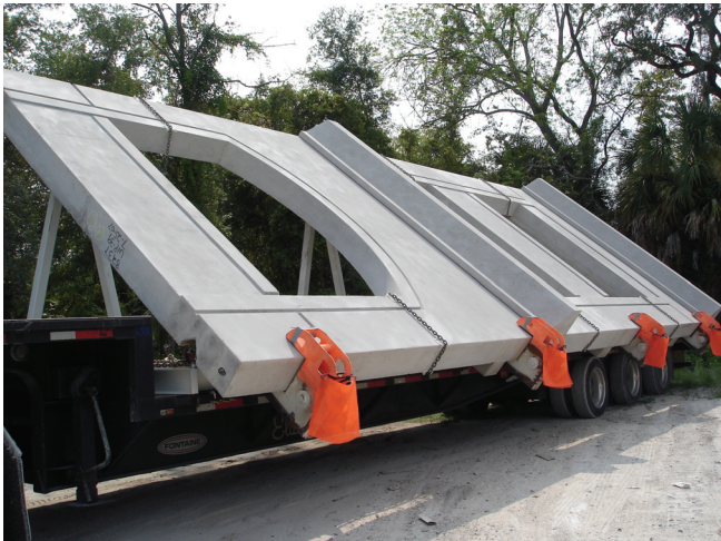
Heavy Architectural Panels Haul with Ease